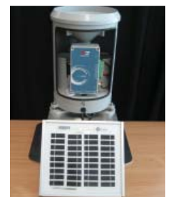
Fits Inside TBRG