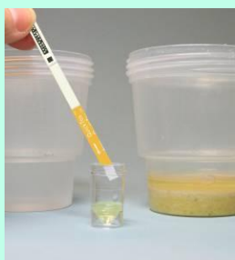
Place strip in vial