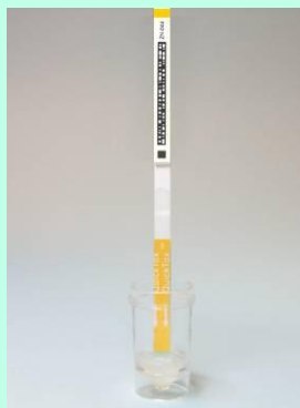
Wait 5 minutes for results