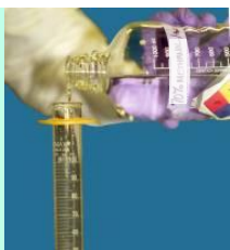
Measure solvent, add to ground sample