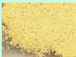
Correct 20 mesh grind for corn

*Available as accessories – see list on Page 3