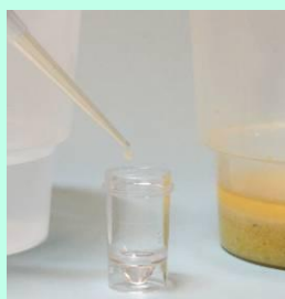
Add Buffer to vial first, then add extract; mix well with pipette tip